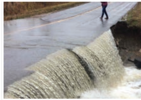
Chemin des Érables, spring 2017.

Basic work in 2018 will be aimed at protecting the roads by improving surface water drainage. This may include replacing and enlarging culverts, correcting cross